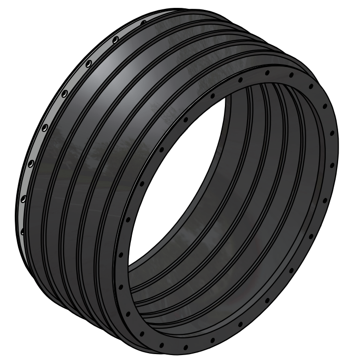
Tolerances for backing flanges and flow liners on basis of DIN EN 1092-1