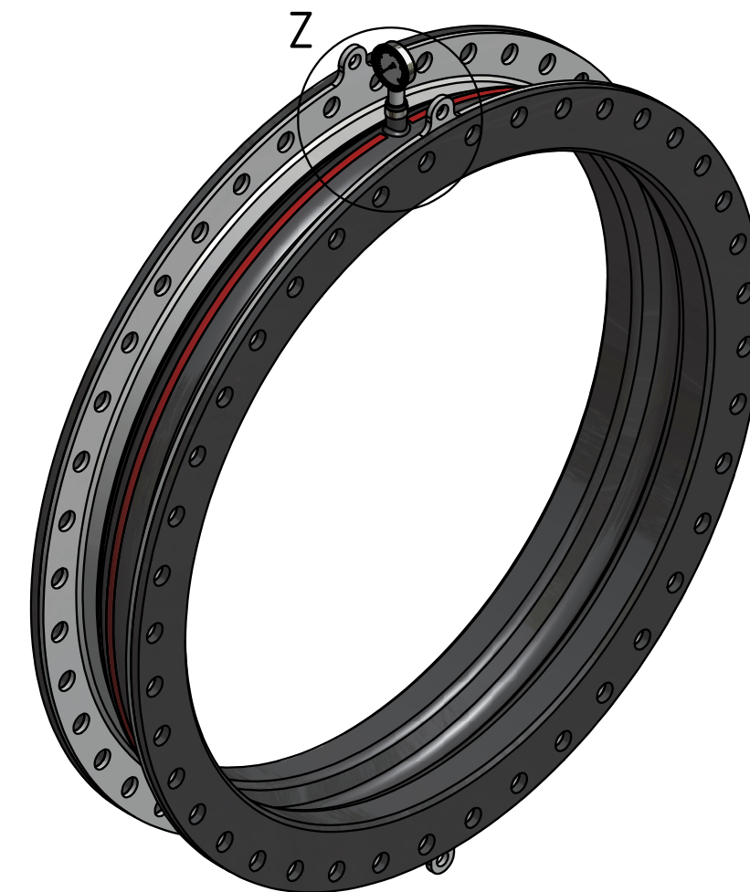
Tolerances for backing flanges and flow liners on basis of DIN EN 1092-1