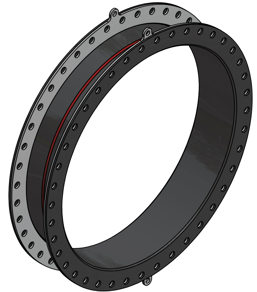
Tolerances for backing flanges and flow liners on basis of DIN EN 1092-1